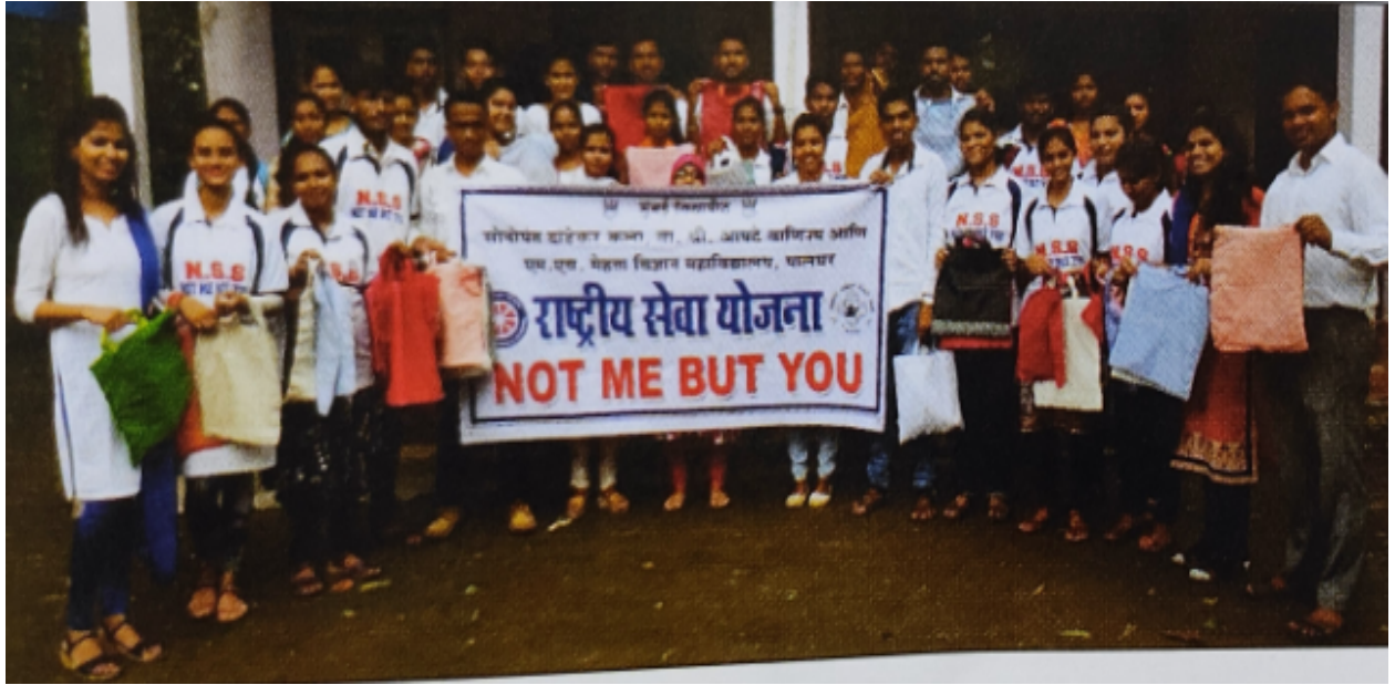
NSS Unit conducting “Cloth Handbag Making Campaign